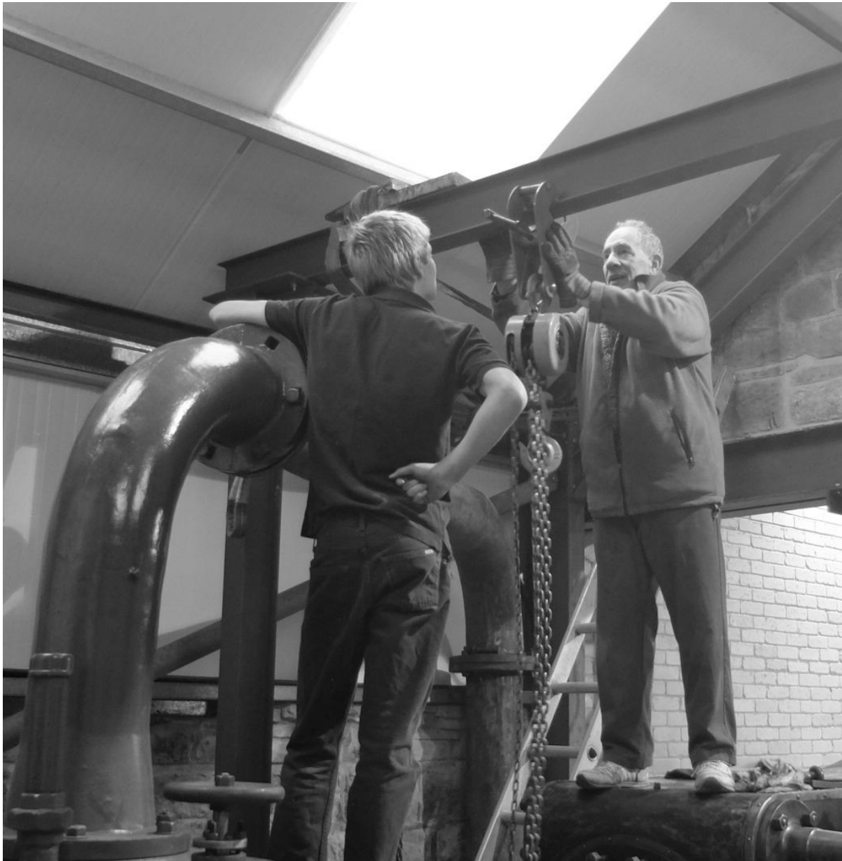
Few of the jobs are light work but the young and the....more mature get on well

But first we had to fit the gland bearings on the piston rod. These are the bearings and seals that prevent steam from escaping where the rod passes through the end covers.