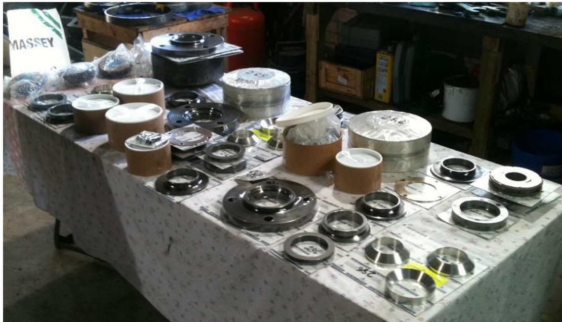
1. The set of parts for all three gland packings delivered by Hoerbiger

The HP piston and rings were assembled and locked in position on the rod. Now it is in the bore, we will probably never see it again. Using cables and pulling gear, we have been able to move the rod to and fro, and it moves freely and smoothly.