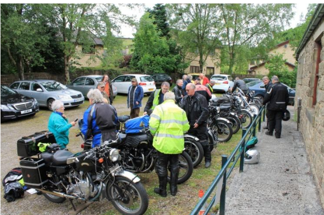
Some of the Vincent Club members on arrival.

Once again Bancroft opened its doors to a group of motor cyclists on Sunday, this time it was for those who had not only come out for a ride but who had also come to see the Vincent motor cycles that were to be featured for this steaming. Vincent HRD was once thought to be the best that the British Motorcycle Industry could produce; it was excellence in engineering, superb